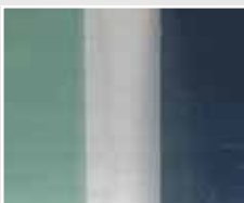
GLASS INFILL PANELS IN CLEAR, SMOKE GREY & GREEN