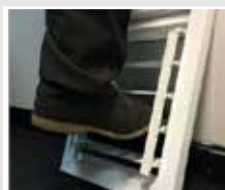
100KG LOAD RATING AT A SPAN OF 1 METRE