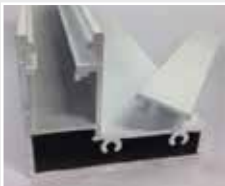
L & Z FRAMING WITH SNAP IN COVER