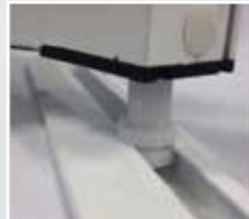
FLOUTING BOTTOM PIVOT