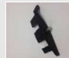
BLADE END CLIPS IN WHITE OR BLACK