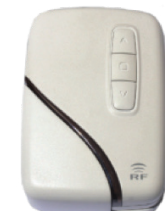
E-Port RF Controller