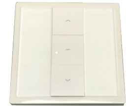
Wall Mounted Remote

Motorised Roller Shutters offer convenience especially for hard to access areas. They can be controlled by either a hand held, wall mounted or key chain remote. Control multiple Roller Shutters at once with 1 controller which operates up to 15 Roller Shutters.