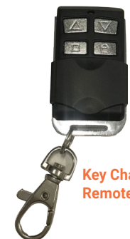
Key Chain Remote