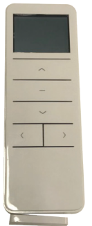
15 Channel Remote