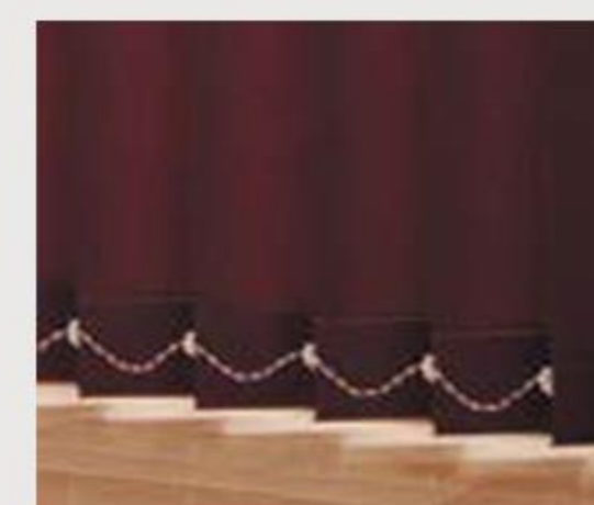
Weights and chain at base