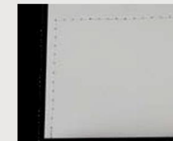
Sewn in weight at base