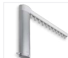
GLYDEA Somfy's motorised Glydea track.