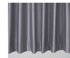
70MM SEWN HEM